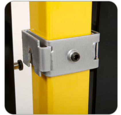
Panels click into place on the bracket.