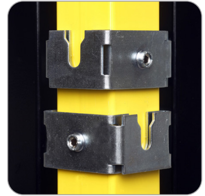
Two bracket corner system.

When maintenance workers need access, quickly remove the panel from the posts and the bracket system will stay attached to prevent any misplaced hardware.