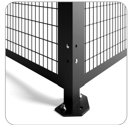
The sturdy 4" x 6" footplates makes the system extremely stable.