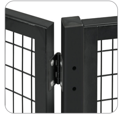
The angle panel kit can join two panels at any angle.

This system can be built into multiple heights by pairing panels in combination with multiple styles of doors. All pieces in the Saf-T-Fence® Partitioning system assemble and install with precision and ease.