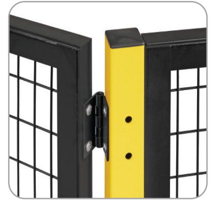
Angled panel kits makes joining panels at any angle fast and easy.

OSHA publishes the list to alert employers about these commonly cited standards so they can take steps to find and fix recognized hazards as cited at osha.gov/top10citedstandards