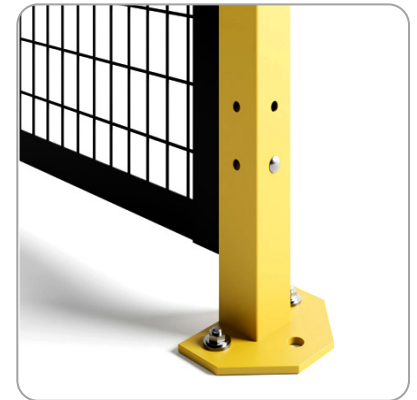
4" x 6" footplates makes the system strong and stable.

Our modular system consists of three system heights, multiple styles of doors and over 30 pre-fabricated wire mesh panel sizes. All pieces assemble and install precisely and easily. You'll enjoy worker safety, less downtime, and compliance with federal safety regulations when you use Saf-T-Fence® to fulfill your machine guarding needs.