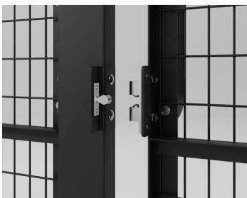
Multiple lock options available (Snap Lock shown)