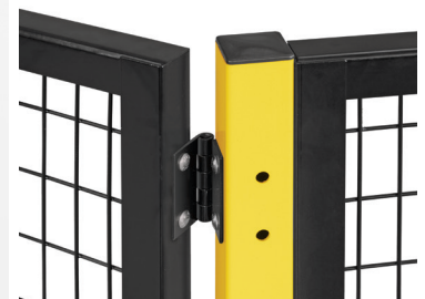
The angle panel kit can join two panels at any angle.