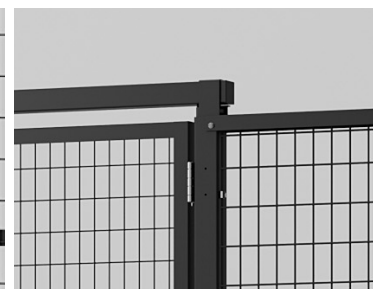
Adjustable Header Bar