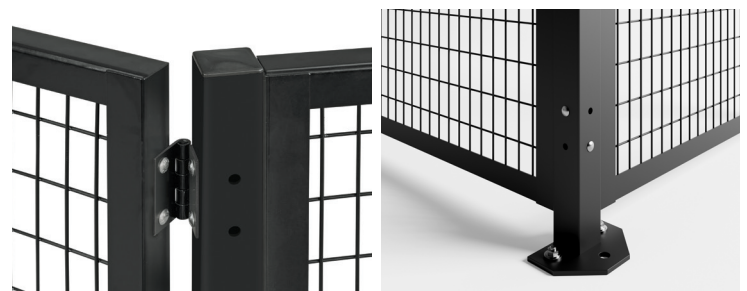
The angle panel kit can join two panels at any angle