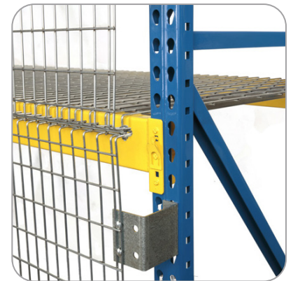
Offset brackets available in different distances.

Multiple assembly options allows the Qwik-Fence® system to be mounted flush, or if preferred, mounted with a selection of stand-off brackets. Visually, the galvanized finish will keep your system looking new for years to come.