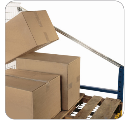
Adjustable extension kits allows extensions of panels past uprights.

OSHA publishes the list to alert employers about these commonly cited standards so they can take steps to find and fix recognized hazards as cited at osha.gov/top10citedstandards