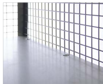
Shelves can be added to make the most of your storage space