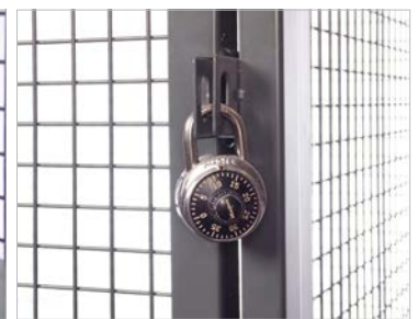
All Dispatcher Lockers come with a padlock hasp for increased security