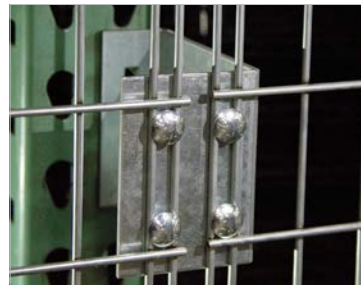
Offset brackets are available in different distances