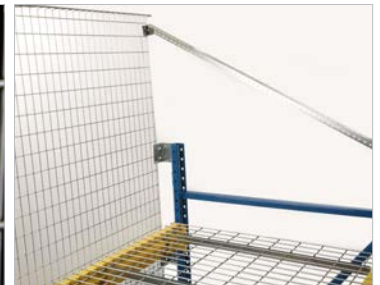
Adjustable extension kit allows you to extend panels past uprights