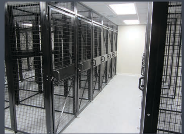
Saf-T-Fence® Partition 'Rooms'

If you are using a garage and want to house cars and sell storage space, our wire mesh Car Locker is well-suited for over-car storage, giving you the advantage of offering two amenities in one.