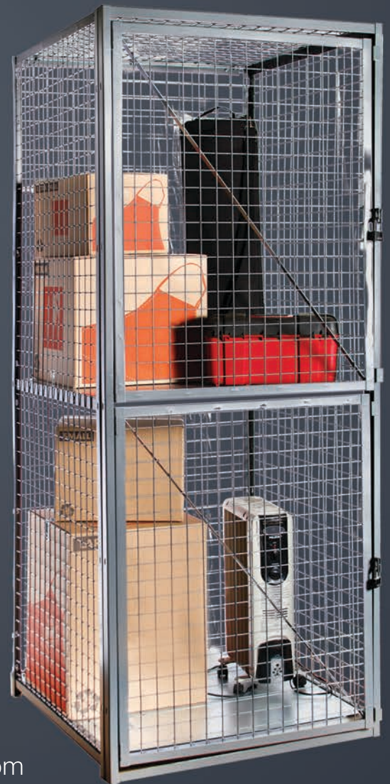
Double-Tier Stor-More® Framed Welded Wire Tenant Storage Locker

With a wide variety of wire mesh products, we can tailor a custom solution to meet your needs. Whether you're looking for tenant storage, package distribution systems, garage storage or something more, we can engineer the right solution for you.