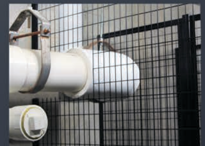
Partitions can be easily modified