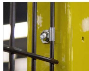
Easy to install with clip and Tek screws