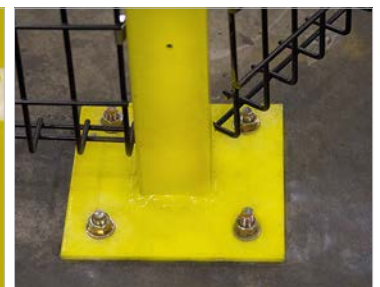
A 6" x 6" footplate is available for areas that need extra support