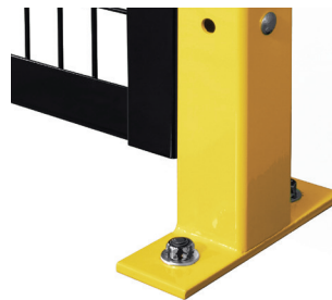
The sturdy 6'x2" footplate makes the system extremely stable.