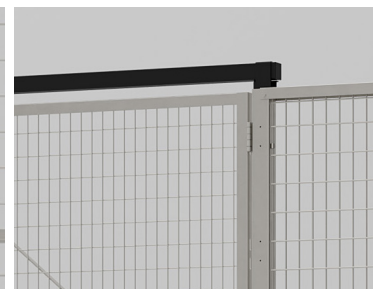
Multiple sturdy door options available