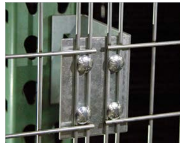
Offset brackets are available in different distances