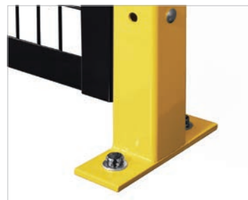
The sturdy 6" x 2" footplate makes the system extremely stable