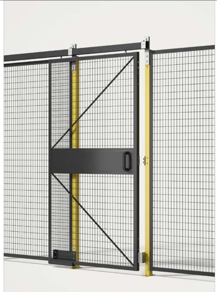
Slide door with snap lock

Our modular system consists of three system heights, multiple styles of doors and over 30 pre-fabricated wire mesh panel sizes. All pieces assemble and install precisely and easily. You'll enjoy worker safety, less downtime and compliance with federal safety regulations when you use Saf-T-Fence® to fulfill all of your machine guarding needs.