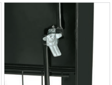
Both models have full-height doors with a three-point locking system