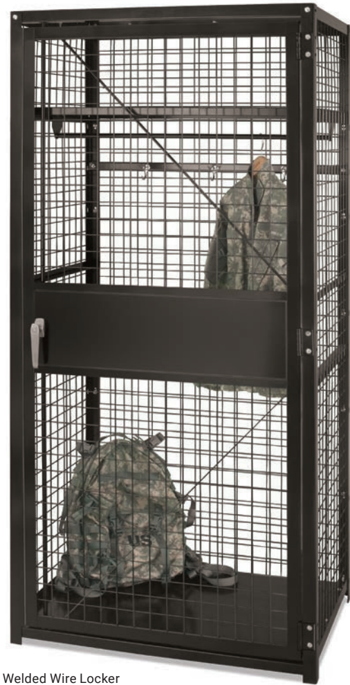
Framed Welded Wire Locker

The key differences between these two models are the backing and door type—the Expanded Metal model offers a solid back panel and bi-parting hinge doors, while the Framed Welded Wire model has an open mesh back and a single hinged door.