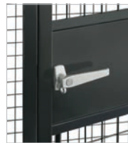
Framed Welded Wire Handle