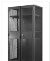
Bolts are not accessible from outside of locker