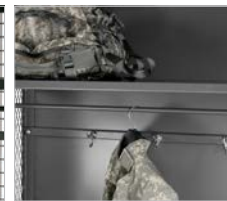
Inside of Expanded Metal - Solid Back