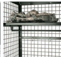
Inside of Framed Welded Wire - Mesh Back