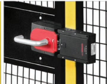
Safety Switch (Multiple Options Available)