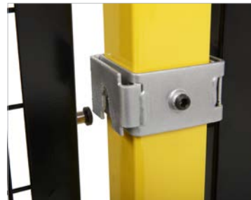
Panels easily lock in place with bracket