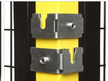
Use two brackets for corner installation