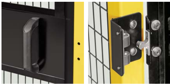
Standard doors include pull handle and built-in door catch.

Our modular guarding systems make it easier than ever to specify, order and install. We offer ample options in posts, panels, doors and locks. There are three post heights, six styles of doors, and over 30 pre-fabricated wire mesh panels and accessories. All bolt together, and are built for exact fit and easy assembly. Mesh openings, heights, clearances and tolerances can help you meet OSHA, Canadian (CSA) and European (EN) safety regulations.