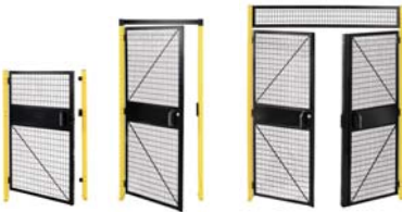
Hinge (right door: header included with 7-ft. system)

Posts are sold separate and not included with door purchase.