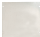
Sheet metal bottom shelf option