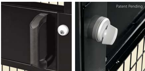
Standard doors include pull handle, built-in cylinder lock and thumbturn.