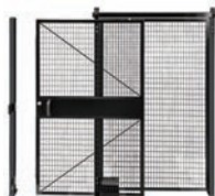
Clear Access Slide (fixed panel sold separately)