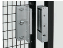
Slide Door Magnetic Lock