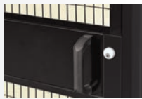
Cylinder Lock and Pull Handle

panel sizes and accessories (see reverse side). All pieces assemble and install precisely and easily. You enjoy an unobstructed view of your property, plus full air and light circulation, all with no change to your lighting or heating systems.