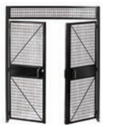
Hinge Pair (transom included with 8' and 10' system)