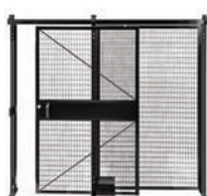
Slide (fixed panel sold separately)