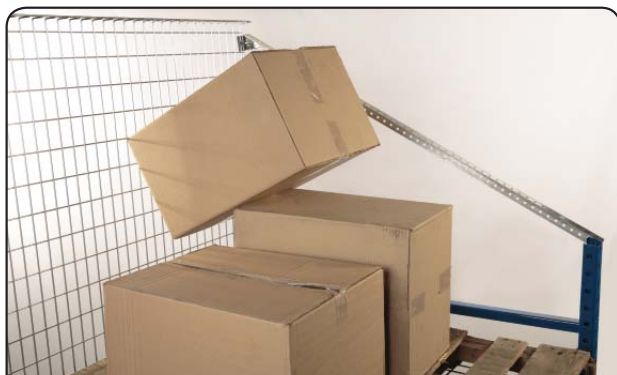
Extra-High Extension Kit Prevents Unsafe Conditions