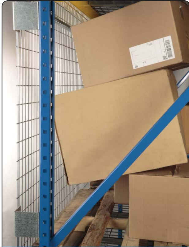
Keep Your Products Safe and Secure