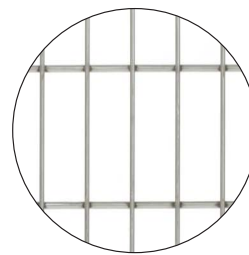
Quality Steel Construction is Sturdy and Long-Lasting